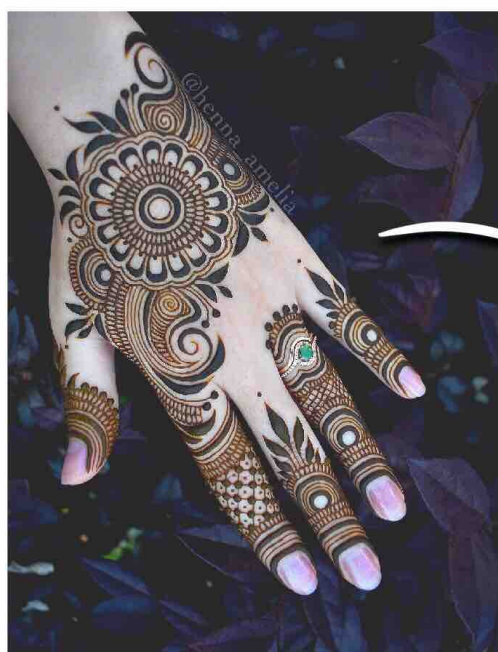
Henna paste applied on the skin

Once the paste is removed the initial stain will appear bright orange. From there it is best to avoid direct contact with water for 24 hours. The orange stain will darken over the next 1—2 days, becoming a beautiful and deep reddish-brown. This shade will last through the life of your henna, fading gradually on its own after about a week. For brides, this means the optimal time to receive your henna is 2—3 days before your wedding.