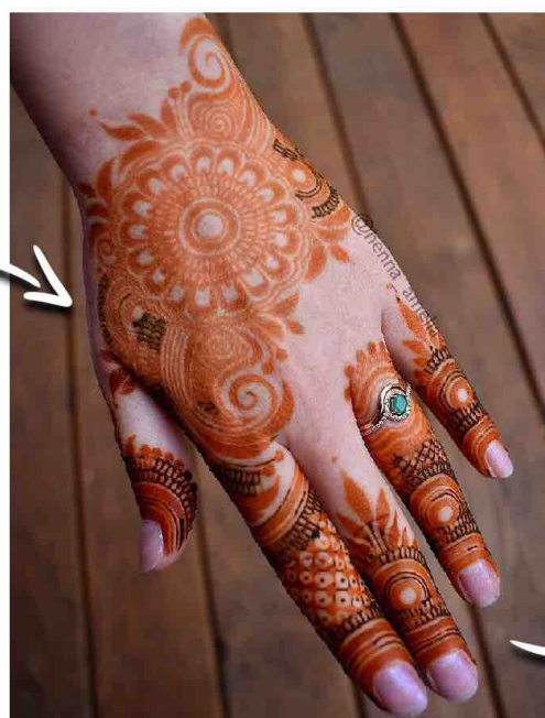
Fresh henna stain – just after removing the paste